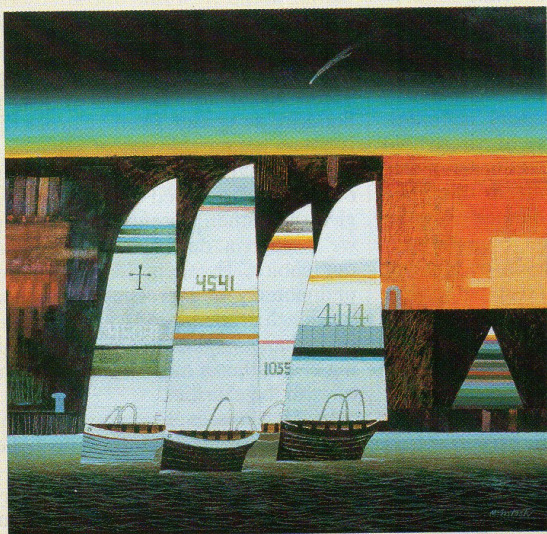
Night Sail acrylic on board