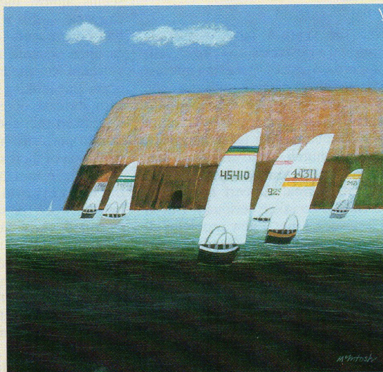
Mull to Staffa acrylic on board