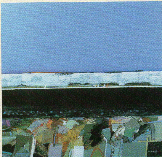
Winter Estuary acrylic on board