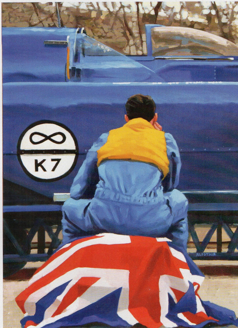
Clockwise, from above: A Moment Alone, at Lake Eyre in '64; Back to the Drawing Board; Off Course, with Humber support car at Bonneville in 1960; Immortalised, before tragic final run on Coniston Water in '67